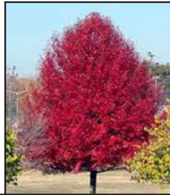
Black Gum All Locations