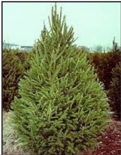
Norway Spruce All Locations