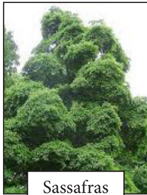
Sassafras All Locations