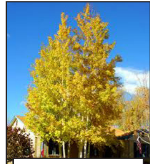
Bigtooth Aspen All Locations

In Memory of In Honor of In Recognition of