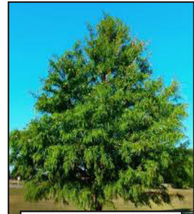
Bald Cypress All Locations