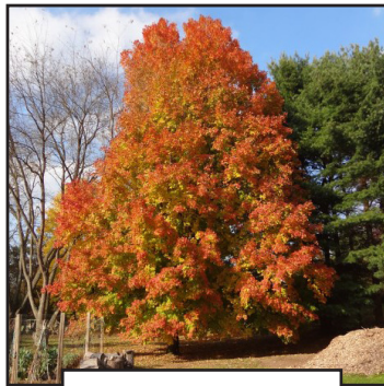
Sugar Maple BBP, BCP, BHP, BNP