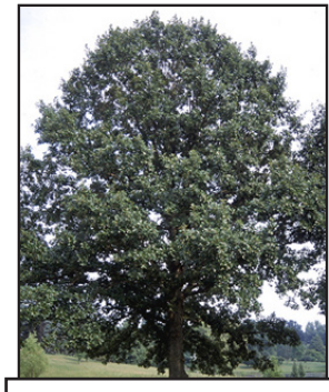
Swamp White Oak BBP, BCP, BHP, BNP