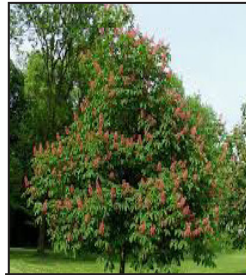
Horse Chestnut All Locations