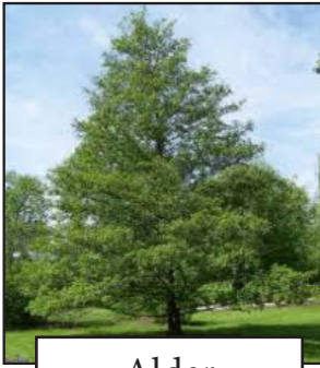
Alder All Locations