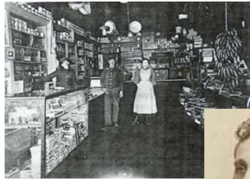
Richie's Grocery Store